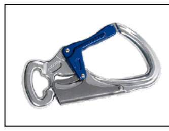
IKV 11 (EN 362:2004-T)